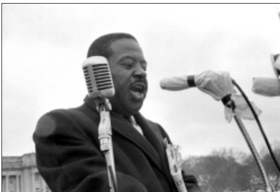
Reverend Ralph Abernathy (left) and Dr. Martin Luther King, Jr. (center, photo on right) at the 1964 Frankfort march.