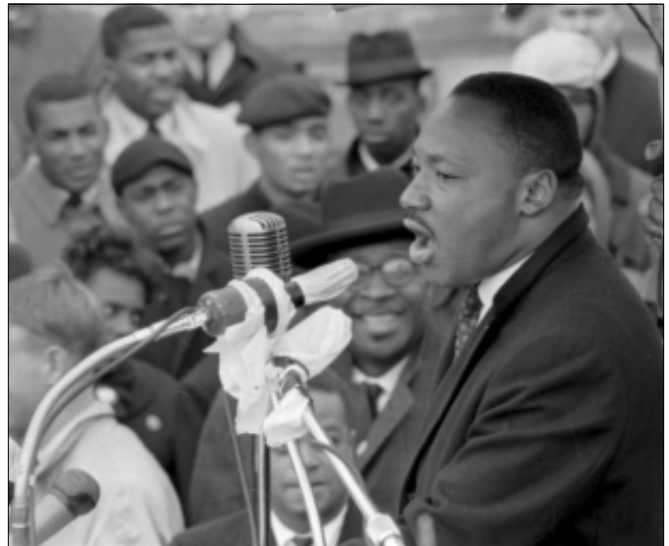
Dr. Martin Luther King, Jr. speaks to the crowd.