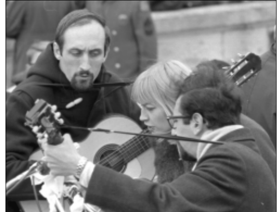
Peter, Paul and Mary perform at the Frankfort rally. Mary Travers is a Louisville native.