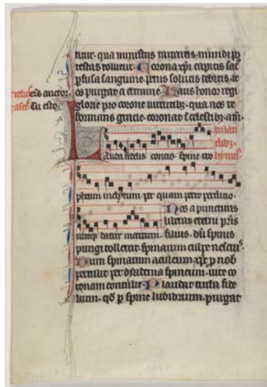
Antiphonary, France, 15th century, fragment - verso