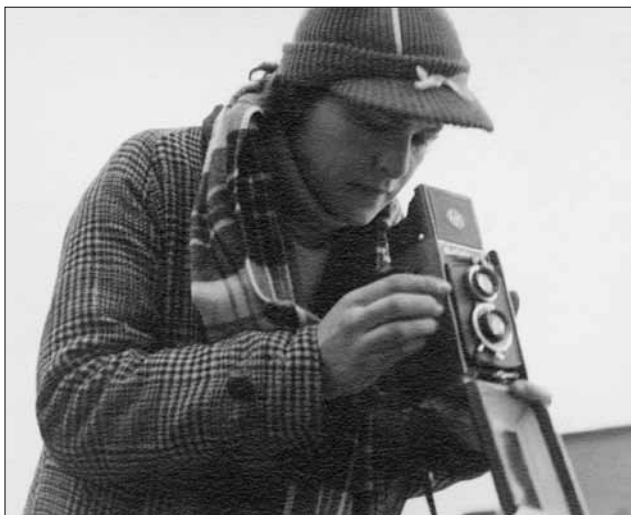
Above: Margaret Bourke-White using one of Corwin Short's cameras.