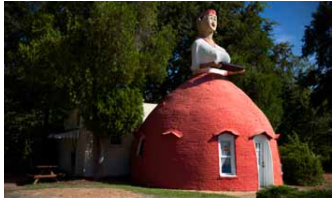
Mammy's Cupboard, US 61, near Natchez, MS, September 2010

Reception & Gallery Talk March 29, 2012, 5:00 – 7:00 pm