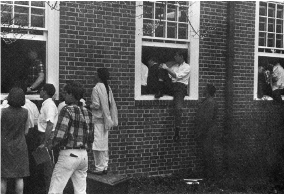
Students hang out the windows of the Allen Court Room in the Law School to listen to Dr. King.

The Owl is published six times a year as an online PDF publication by the University of Louisville Libraries, Louisville, KY 40292.