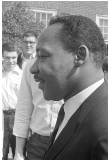
Dr. Martin Luther King, Jr. arrives at the law school.