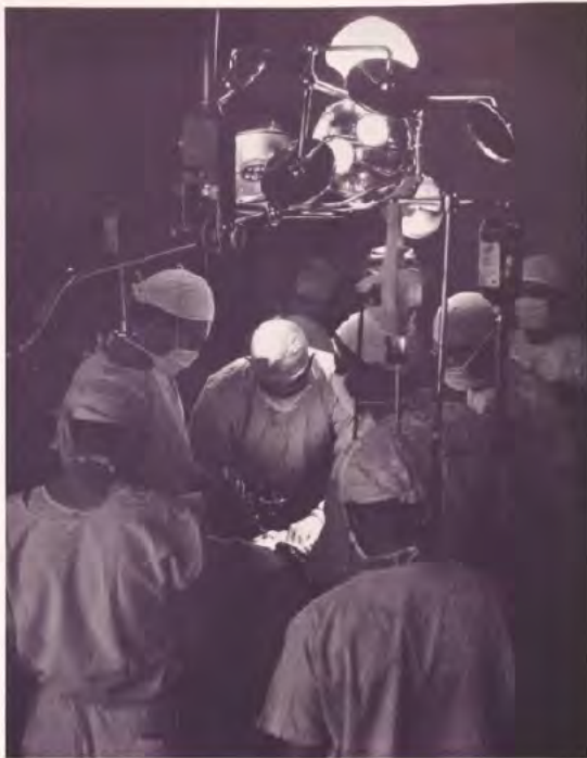
TODAY'S TRAINING AT THE SCHOOL OF MEDICINE REAFFIRMS THE IDEALS AND TRADITIONS THAT HAVE GROWN WITH THE YEARS

to the schools, sports and social activities at UofL during that time. To the left is a photograph of hands-on training at the School of Medicine.