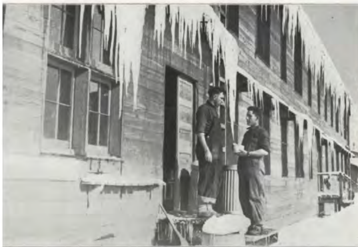
HAPPY WITH THE WEATHER IS BELOW ZERO

Interestingly, our most viewed item to date is the G.A.R. souvenir sporting guide (1895) which is a guide to the houses of "ill fame" (prostitution) for the 1895 encampment of the Grand Army of the Republic that was held here in Louisville, Kentucky. However, our second most viewed item, Camp Zachary Taylor , is one of my favorites, mostly for its inclusion of so many photographs, like the one below (short sleeves in subzero weather?!).