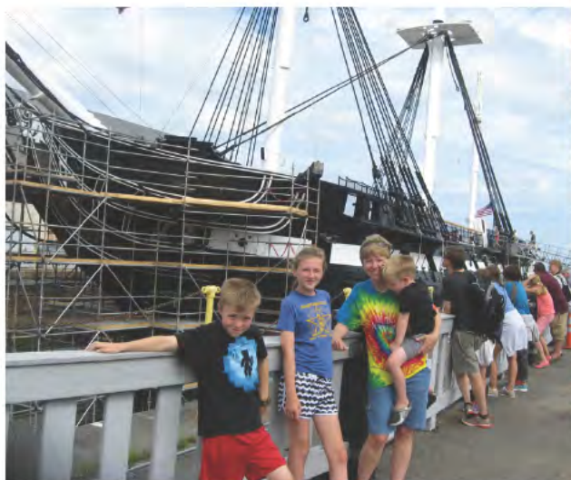
AMJ with kids in front of the USS Constitution in Boston