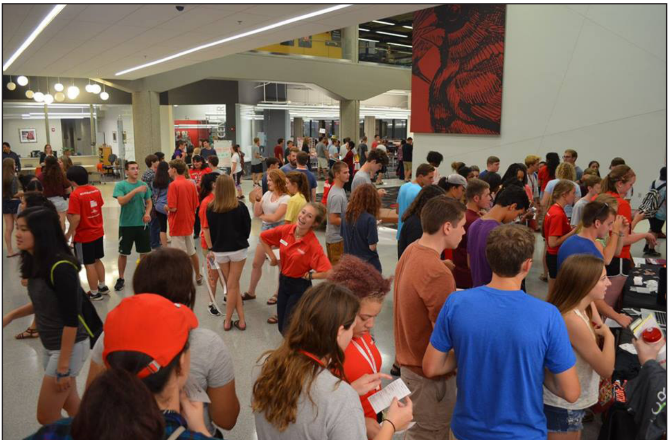
Beginning of the night at 2017 KBITS, the party was just getting started!

Despite its beginnings as a mere placeholder event, Kick Back in the Stacks quickly grew in scope and began garnering a reputation as a highlight of Welcome Week in its own right. Over the years students have been treated to anything from caricaturists to fire dancers, with no two iterations of KBitS being the same. Now, with Kick Back in the Stacks’ new status as a “Signature Event,” the Libraries can continue to utilize this opportunity as a central showcase for next year and many Welcome Weeks to come.