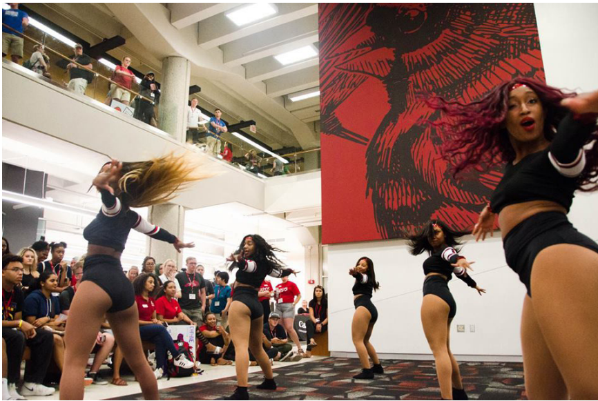
The Dazzling Cardettes dance team performing at 2018 KBITS.