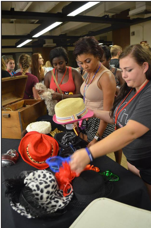
Students picking out props for the photo booth at the 2016 KBITS event! Photo by Ashley Triplett (left)