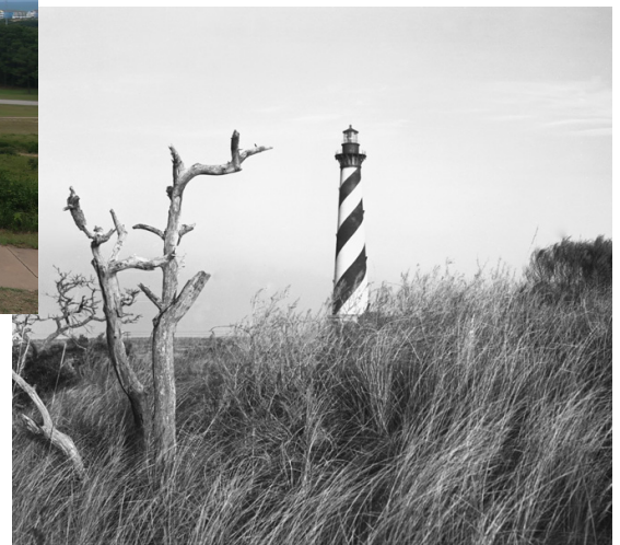
View of Hatteras Lighthouse, looking east. Photo by Eugene Badger, 1945. Photographic Archives, Standard Oil (New Jersey) Collection.