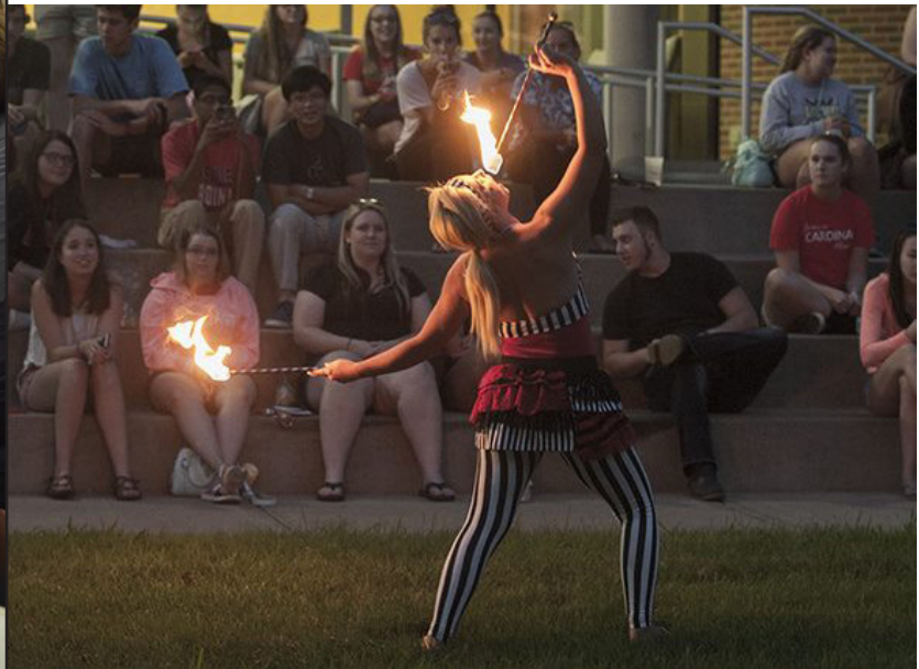
Students sit on the west steps, outside Ekstrom Library.

The Owl is published six times a year as an online PDF publication by the University of Louisville Libraries, Louisville, KY 40292.