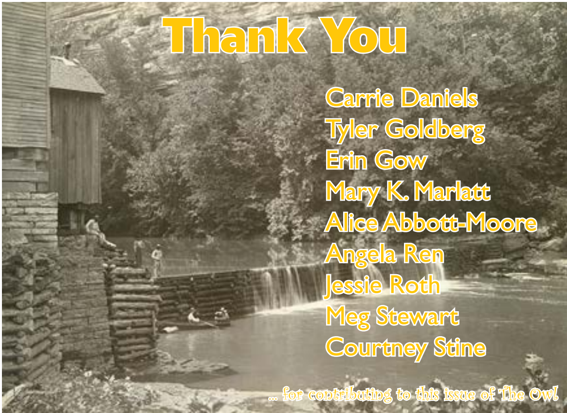
Famous fishing dam in Mercer County, early 1900s. Photo by Archibald Rue, Arthur Ford Collection, 1977_001_117