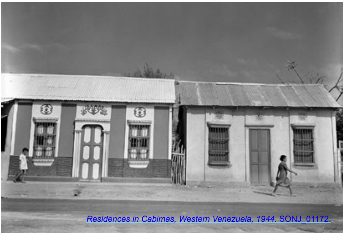
Residences in Cabimas, Western Venezuela, 1944. SONJ_01172.