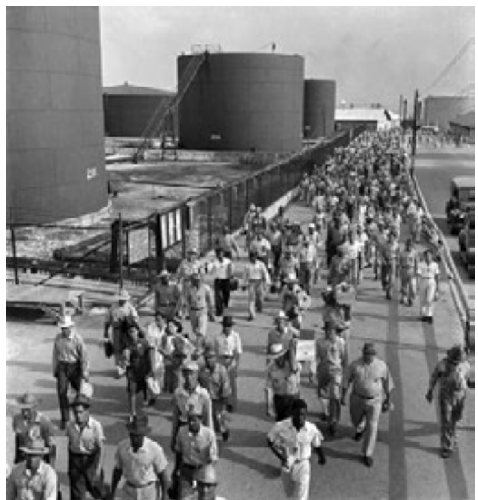
Quitting time, Aruba, 1944.