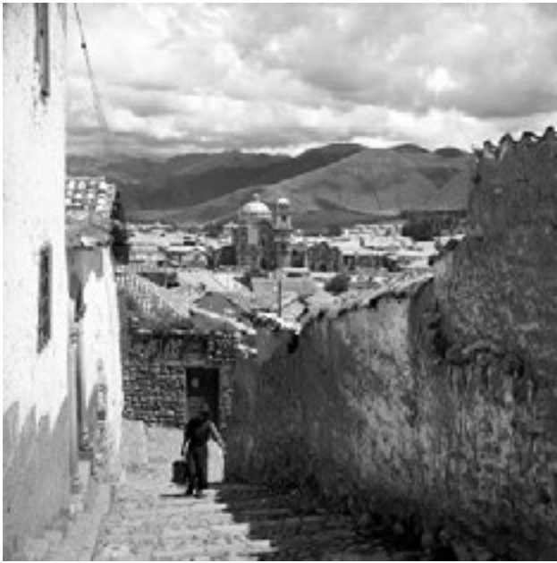
Street in Cuzco, Peru, 1955.