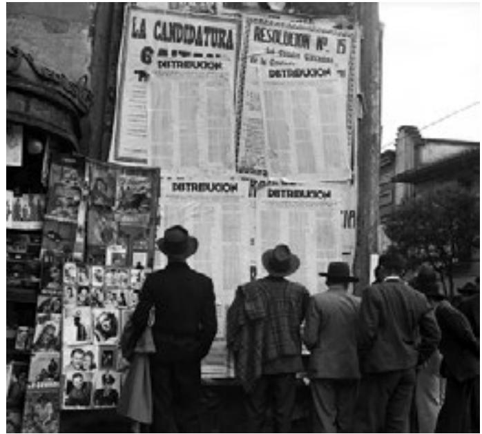
Voters examining list of polling places, Bogotá, Colombia, 1946.

graphic materials in our collections. The South American region of SONJ was my first scanning project on the job in January 2020, and I managed to get through 2,500 photographs before the COVID-19 lockdown.